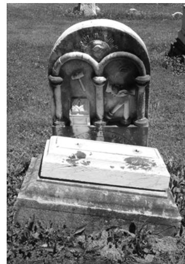
Have you ever wondered if the symbols on a cemetery stone have any special meaning? This is just one of the topics discussed in the new exhibit—"Facing the Inevitable: The Mourning and Mortuary Practices of Monroe County."