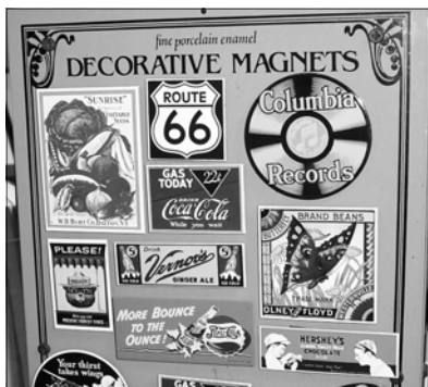
Among the great products sold in the Museum Store are a number of decorative magnets. Many of them feature nostalgic images.

100% of the profits from the store goes to the Society to operate the History Center. Support MCHS by buying wonderful gifts or gift certificates from the Museum Store.