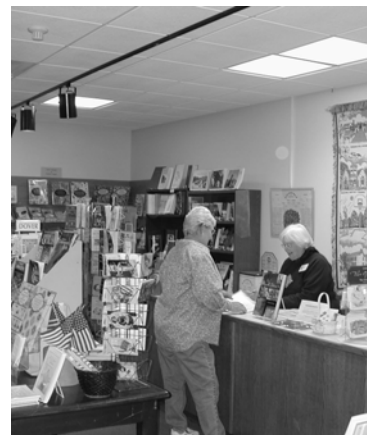
Shopping at the Museum Store is a great place to get unique gifts and a wonderful way to support MCHS.