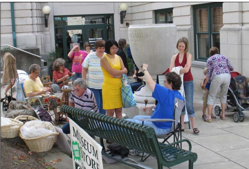
Bottom Left: World-wide Spin in Public Day was observed at the History Center during the Lotus Festival. Spinners and visitors enjoyed the courtyard area on a sunny Saturday.