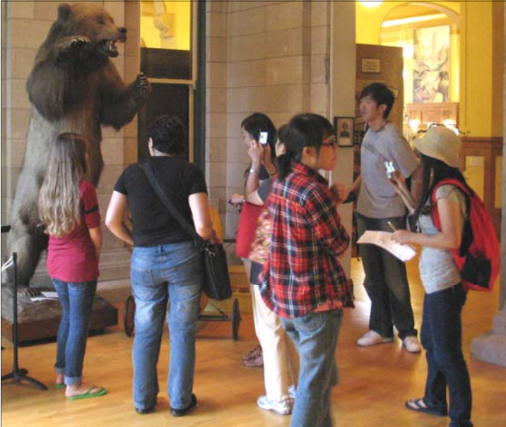
Top Left: IU International Students visited the History Center in August. Some of the students are seen here with an exhibit highlight, the Schmalz Bear. The group enjoyed a picnic and games while getting to know their new community.