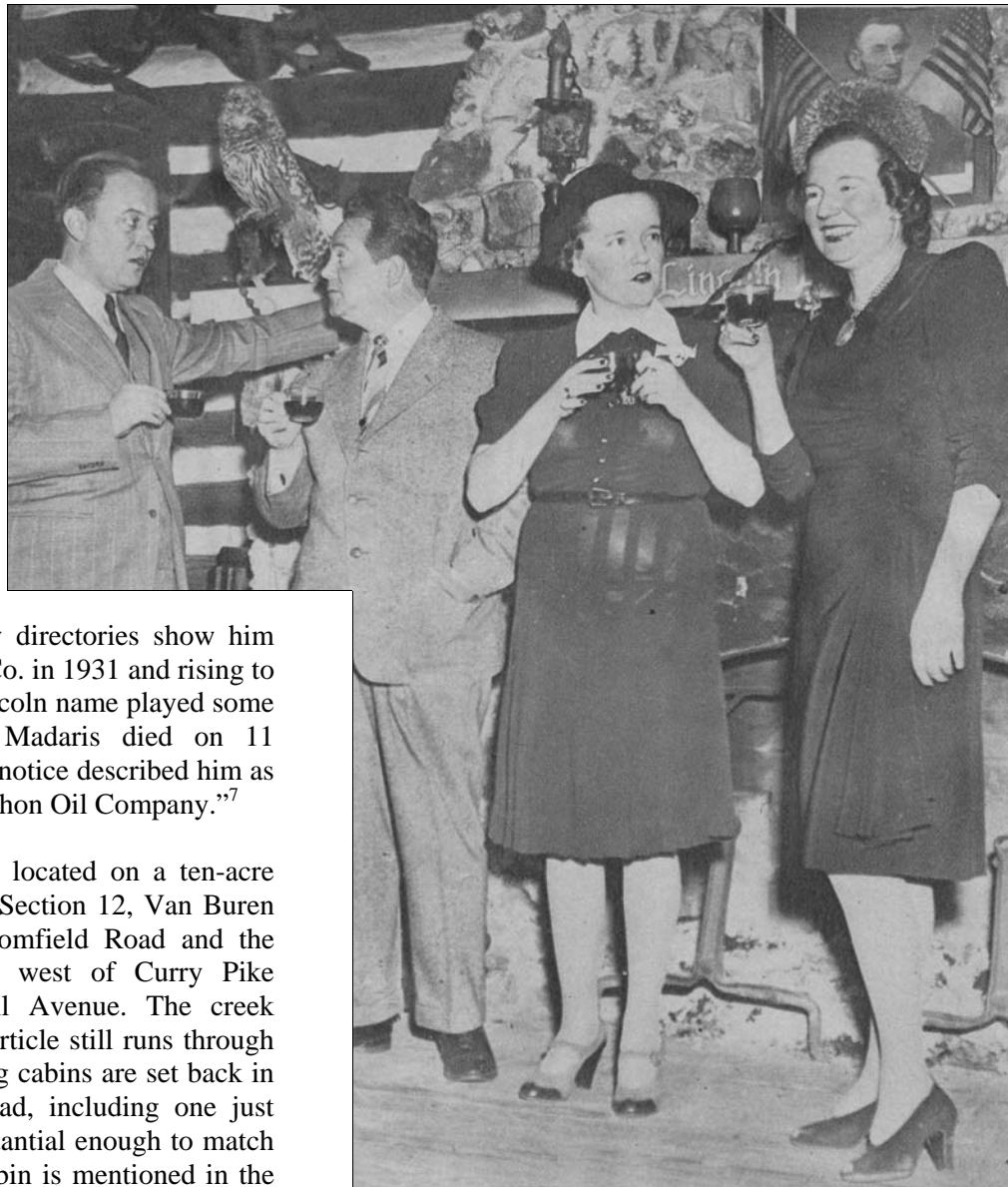
Square dance party at the Abe Lincoln Log Cabin. From the Indianapolis Sunday Star , 22 December 1940. From the collection of the Monroe County History Center.