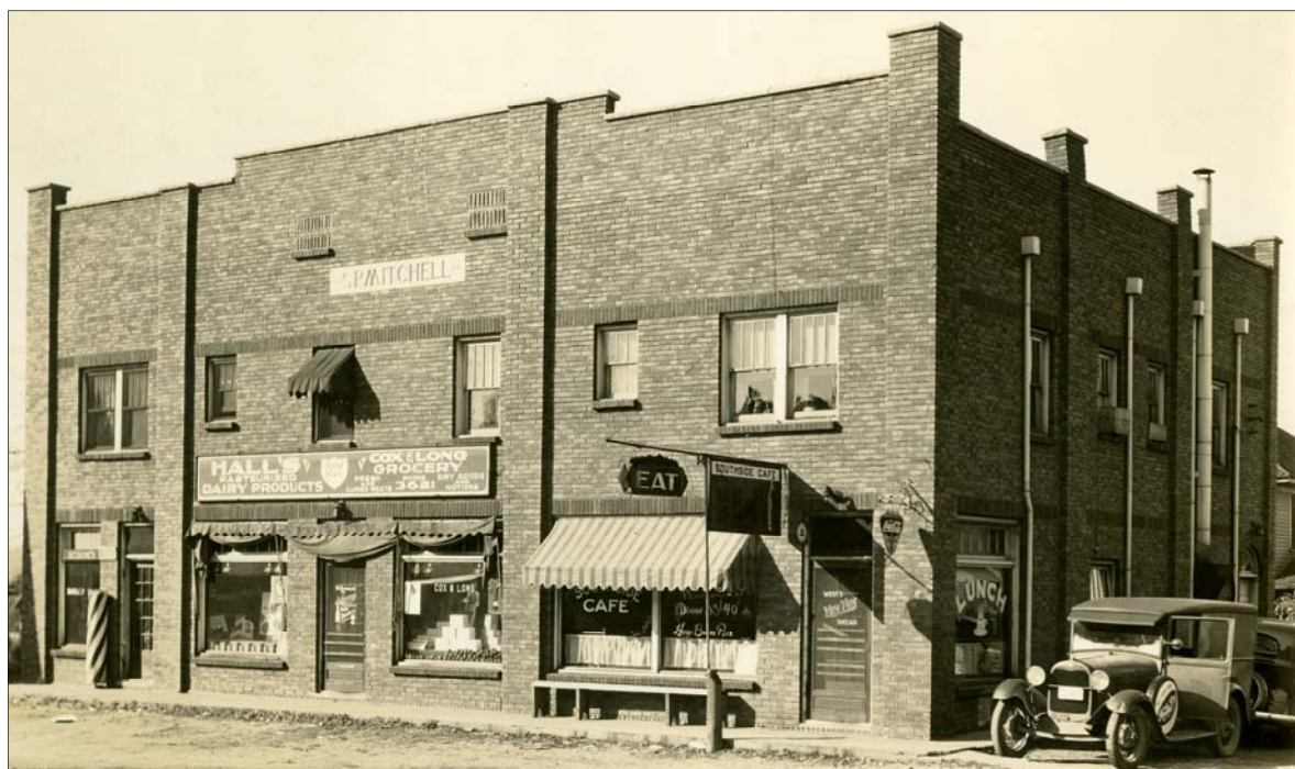
The S. P Mitchell building (built in 1924) housed several businesses, including the South Side Café.