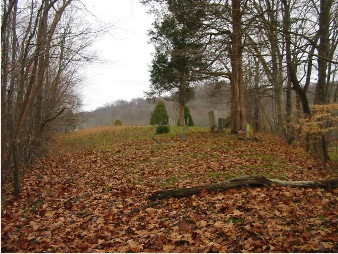
Autumn View 2011 of Frye Taylor McGown Cemetery.

McDaniel, McGown, Paxton, Pollard, Poppina, Runnels, Shireman, Stout, Taylor, Thacker, Unversaw, and Wetherby.